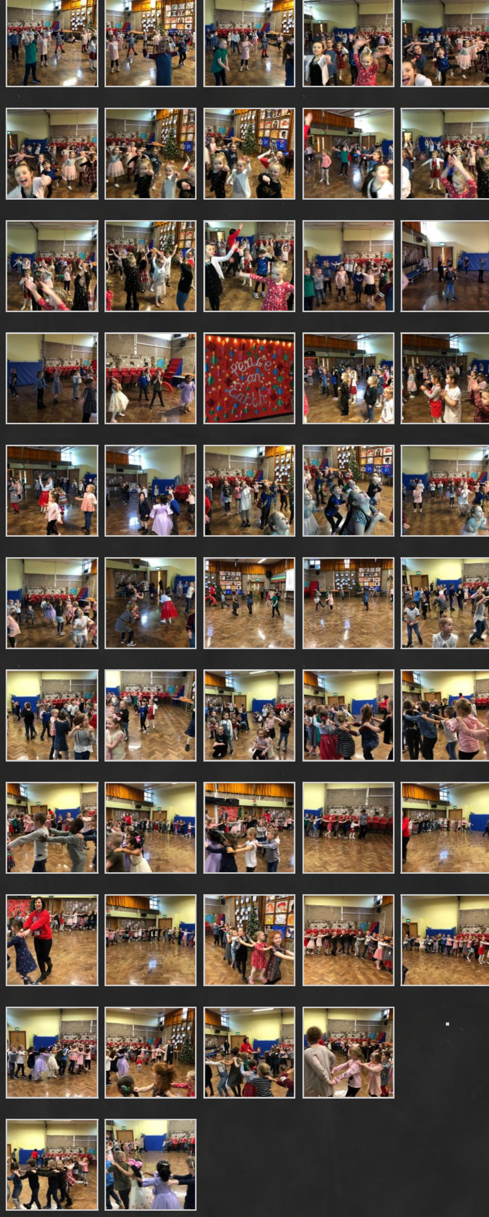
Posted on December 18, 2019 by birdwellmrswallow in Uncategorized • Leave a comment • Edit