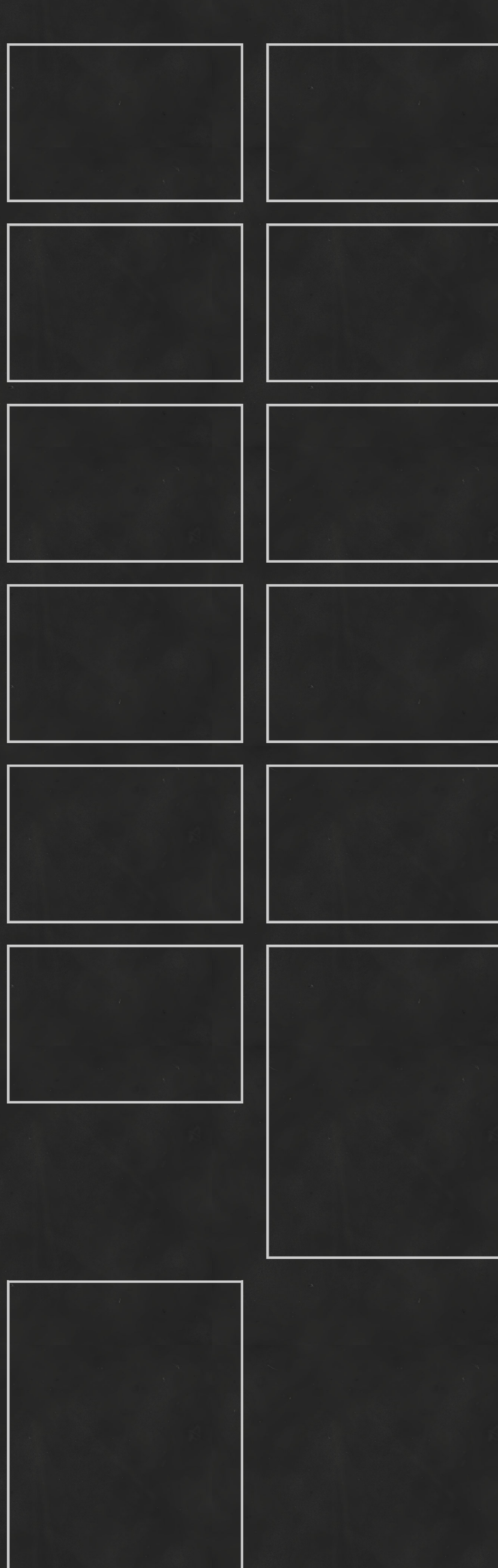
Posted on December 6, 2019 by birdwellmrswallow in Uncategorized • Leave a comment • Edit

We also visited the farm animals and saw some very cute little piglets!