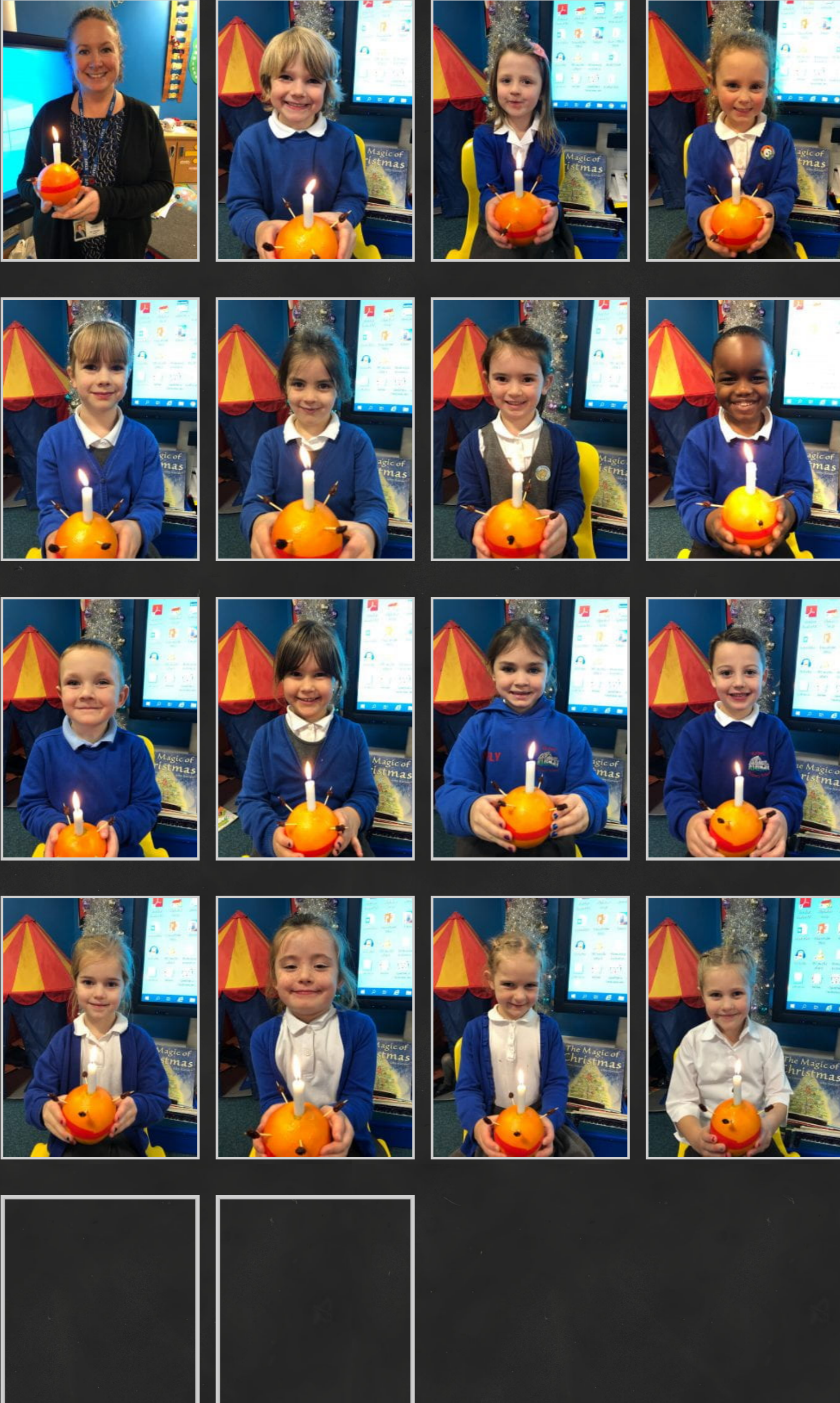
Posted on December 17, 2019 by birdwellmrswallow in RE • Leave a comment • Edit